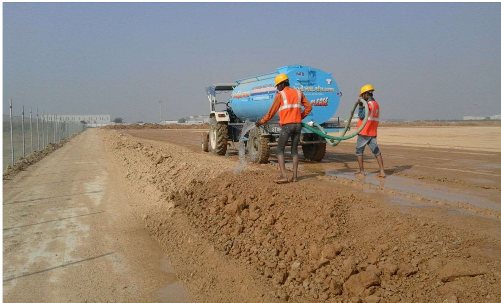
Maxxis GIDC Sananad, Land fill: 200000 cmt