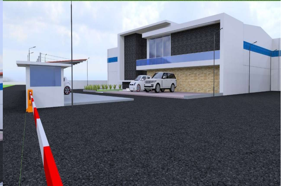
Land Developing and Factory Civil work at Chhatral site