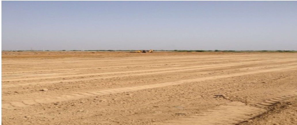
M/s. Jaivel Aerospace Plot-E2 ,GIDC Sanand.II Land Fill: 22000 cmt