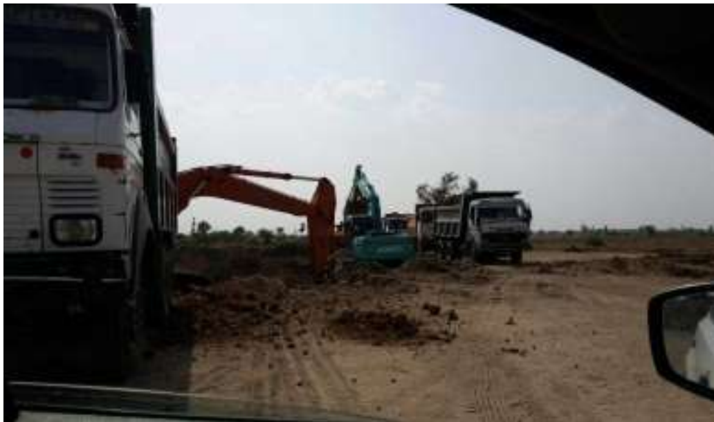
Source at Makhayav Village