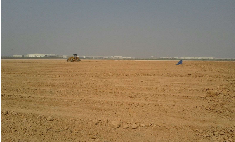
Maxxis GIDC Sananad, Land scrapping: 118000