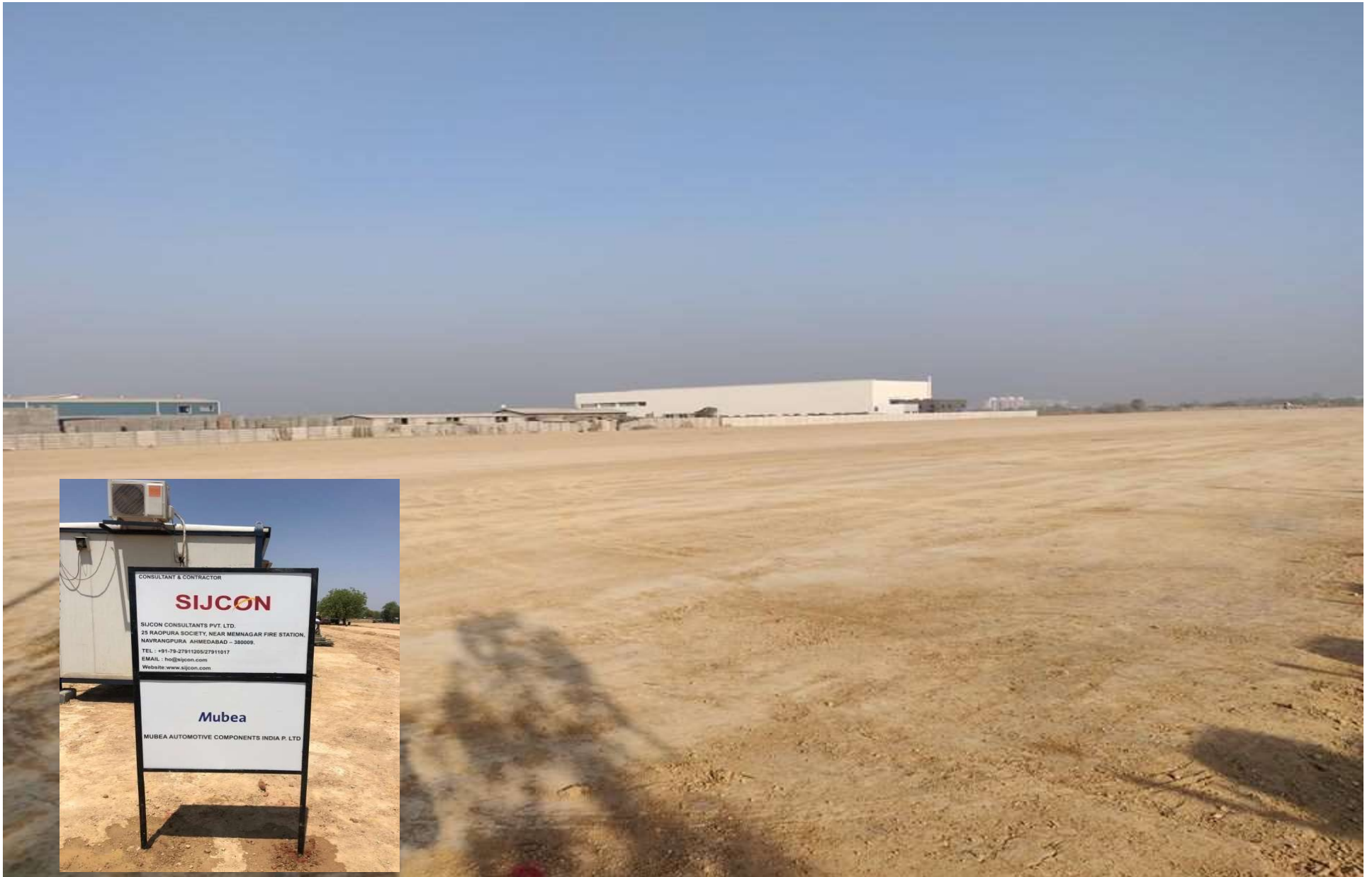
MUBEA Germany at GIDC Sanand II