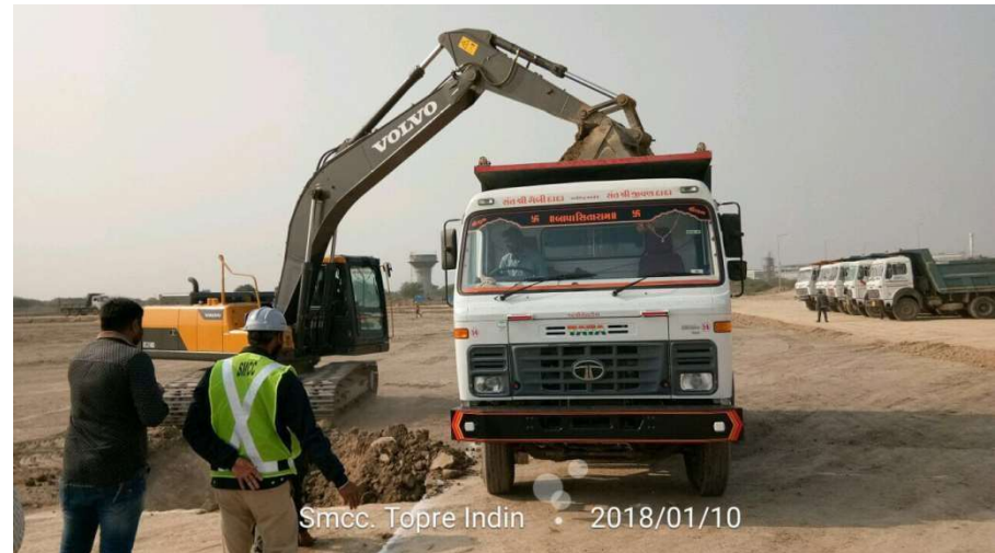
Topre India Pvt Ltd (Japanese Industrial Park) Vithlapur, Mandal, Gujarat Land fill: 66000 cmt