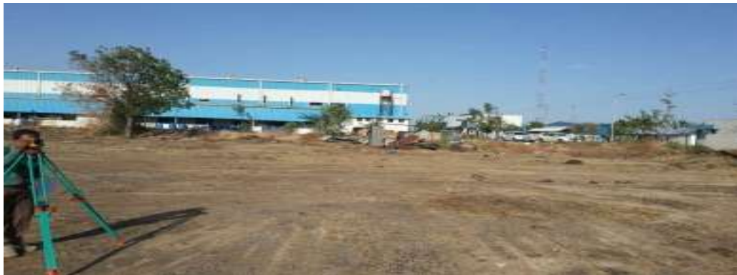
Rucha (vendor Park) GIDC Sanand, Land fill: 10000 cmt