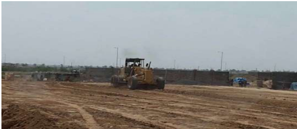
Supreme – Plot-E 273 GIDC Sanand, Land fill: 8000 cmt