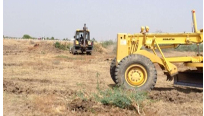
Vyara Tiles, E 3 GIDC Sanand, Land fill: 24000 cmt