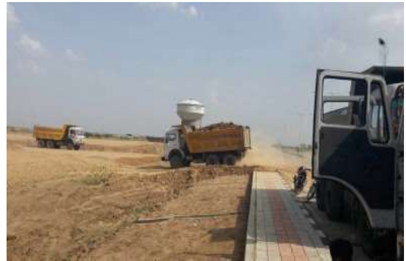
Endurance, E 4 & E 21 GIDC Sanand, Land fill: 251162 cmt