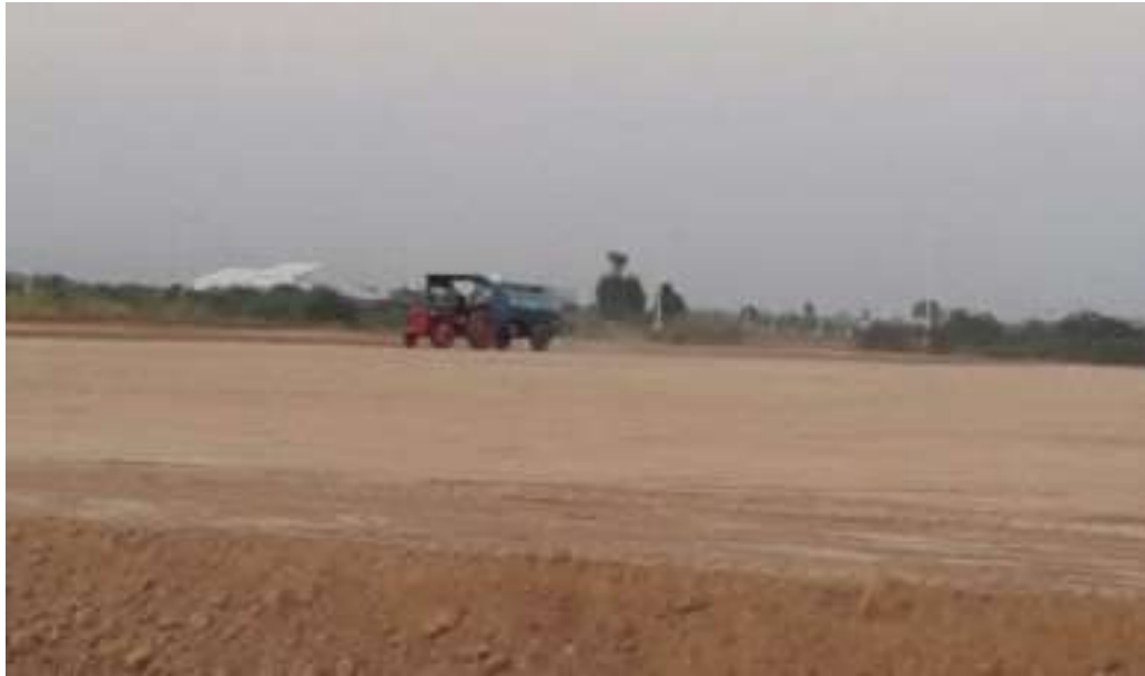
Metacane, GIDC Sananad, Land fill: 15000 cmt