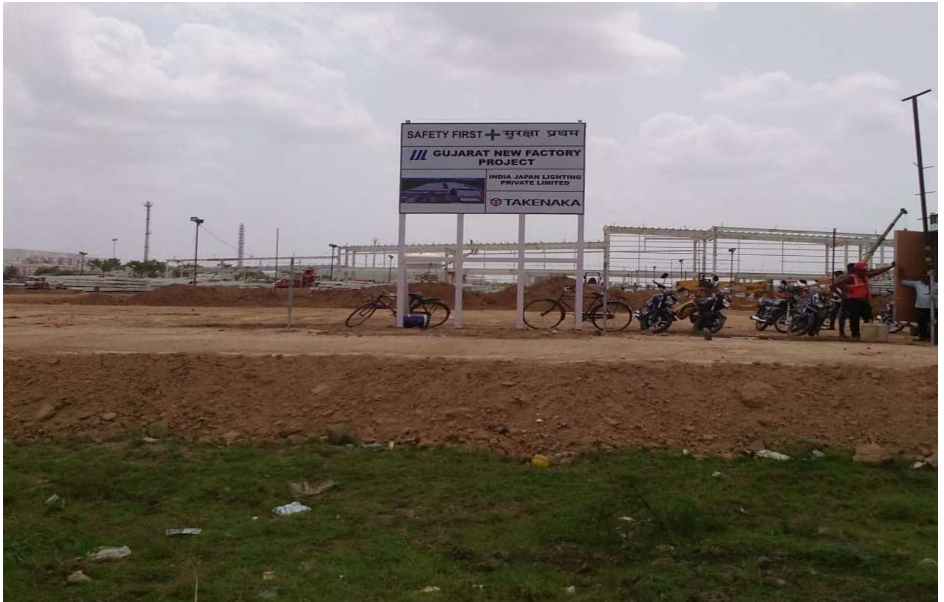
India Japan Lighting ( J ) Gujarat GIDC by TAKENAKA Plot – SM 9/4 at GIDC Sanand II