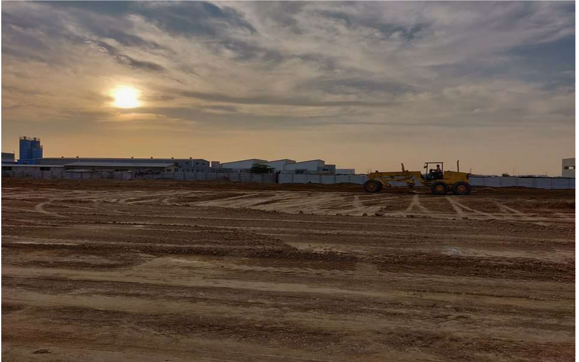
Naleu – Plot- E.22/23/24 GIDC Sanand - II Land fill: 68000 cmt