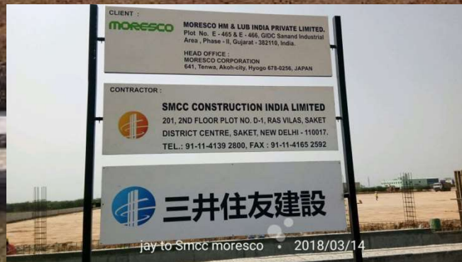
Moresco - GIDC Sanand II Land fill: 58000 cmt